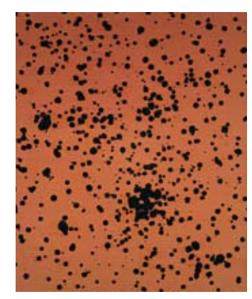
Vincent Geyskens Tâches de beautés 3 (moles) | 2000 Oil on canvas 75 x 60 cm

demands of a new society. Here, the viewer is confronted with violence, aggression, escapism, outsider culture, loneliness and the Munich; curator of the exhibition individualisation of experience. Between the Urbanscape and the Innerscape, a third section reveals a more committed way of ad-