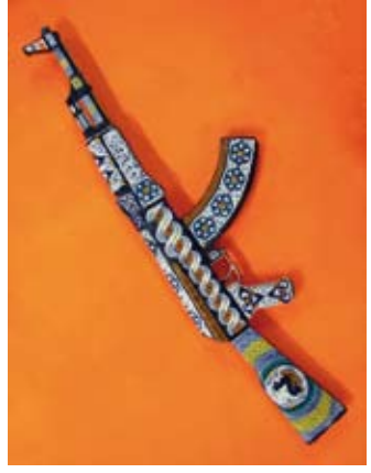
Antonio Riello Ceramic Gun 2006 Ceramics