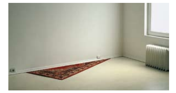
Pravdoliub Ivanov Confusion 2002 installation (carpet/wall)