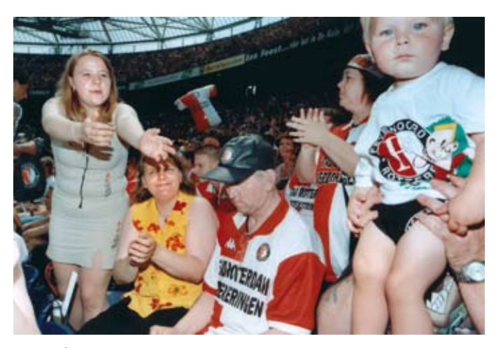
FUN! 2001 C-Print on dibond 50 x 75 cm